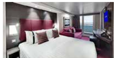
Yacht Club Deluxe Suite