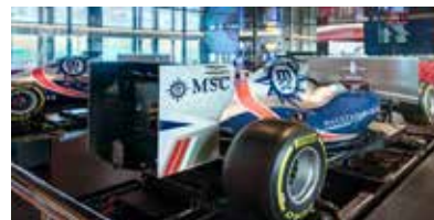
MSC Formula Racer