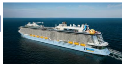
Spectrum of the Seas 海洋光譜號