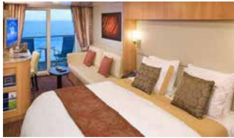
Veranda / Aqua Class Stateroom